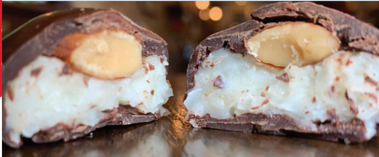
Gretchen's Confections – "Kokomo" is a sweet coconut patty with a toasted almond, dipped in rich dark chocolate. This candy is Vegan!